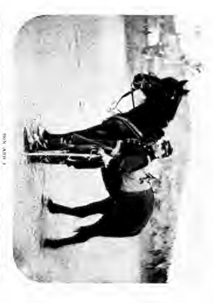
And a timps of the earty of Hancock' Digitiers, Second Afric Corp., Lo. or Edmantic Va., Witter of Target 1 and 15;